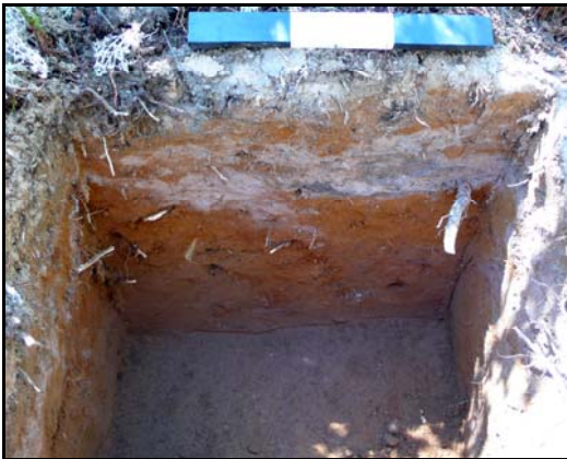
Quick, high-quality test pits.