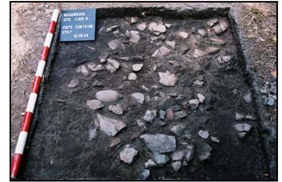
Portion of a Late Woodland midden detected by geophysics.

Geophysical surveys can detect both historic and prehistoric features. Magnetometers detect very minor changes in the earth's magnetic field caused by such things as burnt features (hearths, structures, kilns), pits & ditches (graves, basements, storage), artifact scatters (historic & prehistoric), pipelines & power conduits, foreign material (foundations, different soils, paths) and iron objects.